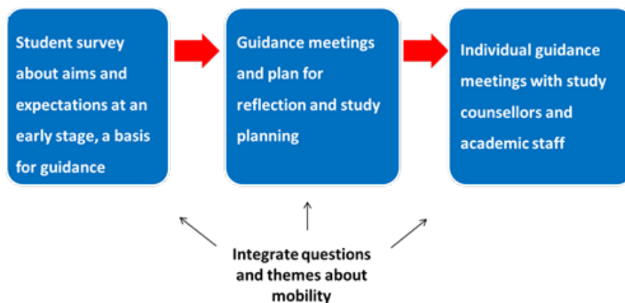
Figure 3. Proposed guidance chain

Experience from Finland shows the effectiveness of using recurring, scheduled guidance, helped by multiple functions that are responsible for guidance at the HEI. Advisory services and guidance can be conducted individually or in a group. At these meetings, plans for reflection and study planning (see below) can be produced or revised and possible student exchanges discussed.